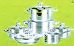
Pots & Pans, Scrap Metal, Ceramics