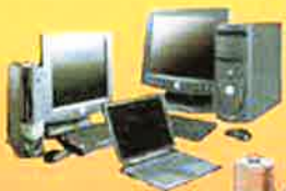
Batteries or Electronics

DO NOT put these items in your recycling cart.