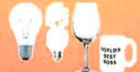
Light Bulbs, Drinking Glasses or other Glassware