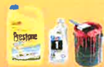
Hazardous or Toxic Product Containers