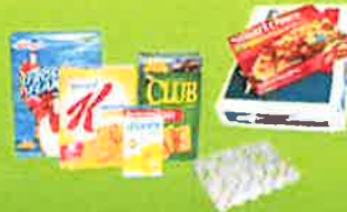
Boxboard, Cereal boxes Frozen Food Boxes