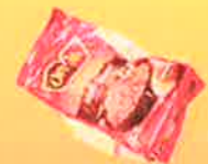
Frozen Food Bags