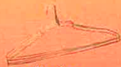
Plastic or Metal Hangers