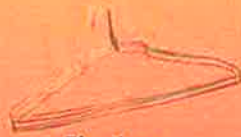
Plastic or Metal Hangers