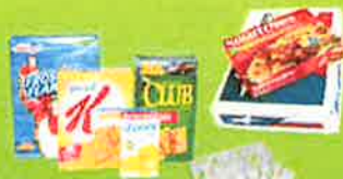
Boxboard, Cereal boxes Frozen Food Boxes