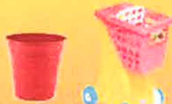
Flower pots, Plastic Toys