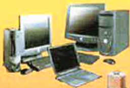
Batteries or Electronics

DO NOT put these items in your recycling cart.