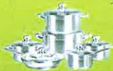
Pots & Pans, Scrap Metal, Ceramics