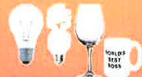
Light Bulbs, Drinking Glasses or other Glassware