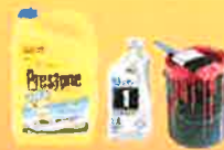
Hazardous or Toxic Product Containers