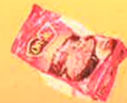
Frozen Food Bags